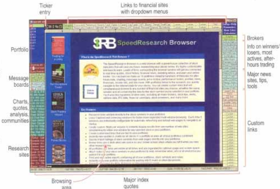
FIGURE 4: SPEEDRESEARCH.COM. This specialized financial Web browser contains five tabs allowing you to move easily from one window to the next. In addition to the Web browser window, you have a collection of buttons, each representing links, as well as the ability to create up to 10 portfolios.

Just as with any new product, it takes a while to familiarize yourself with this browser, especially when you are accustomed to navigating with your default browser.